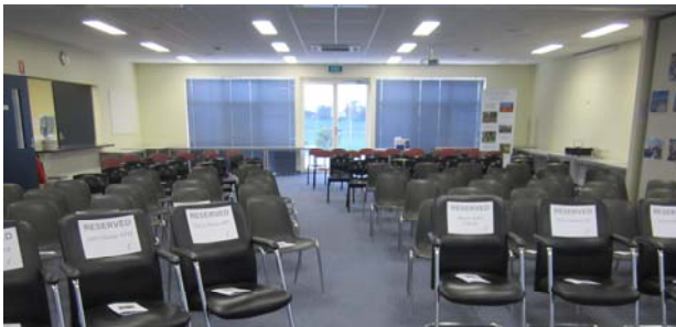
● Double Training Room ●