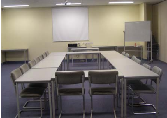
● Single Training Room ●