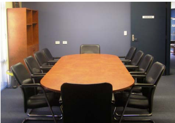
● Board Room ●